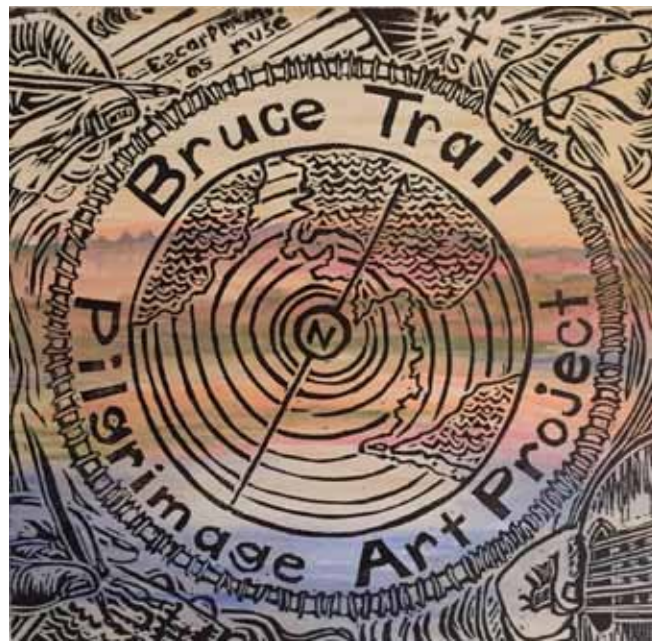
Bruce Trail Pilgrimage Art Project - see details page 9

This year we were host to the BTC 50th anniversary and we celebrated ours at the same time even though the club probably started in 1962. The celebration on