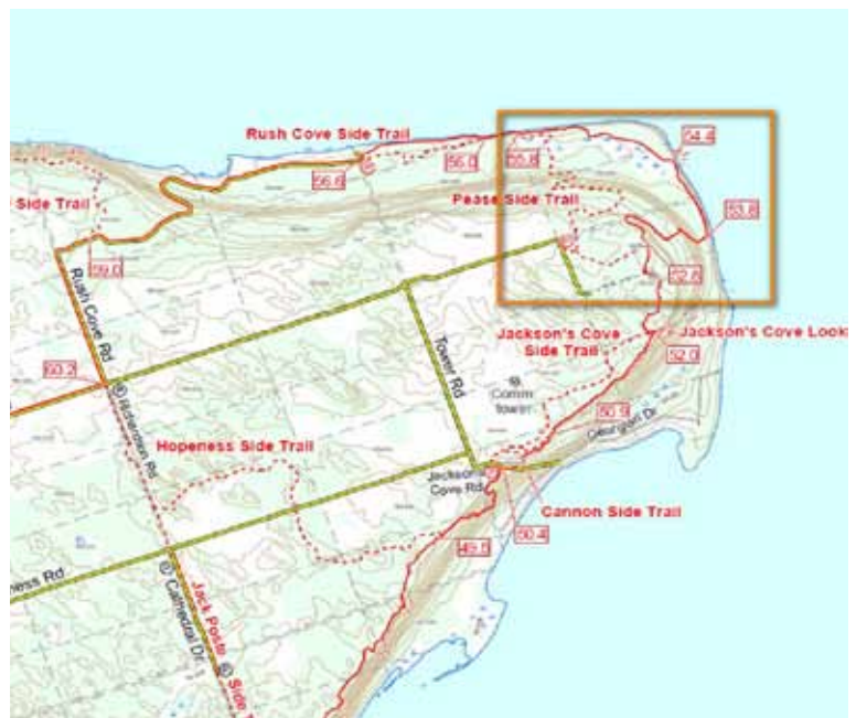
Rectangle shows the Pease Property Donation