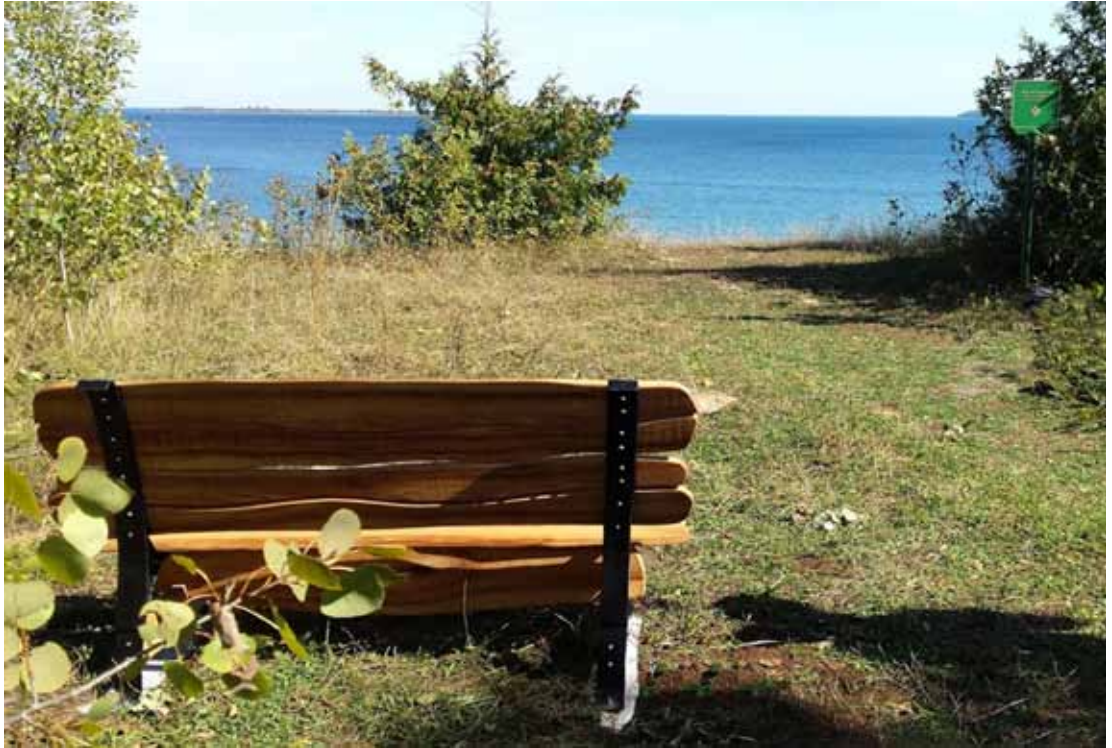
Bench at Cape Dundas lookout - a place to rest and take in the view