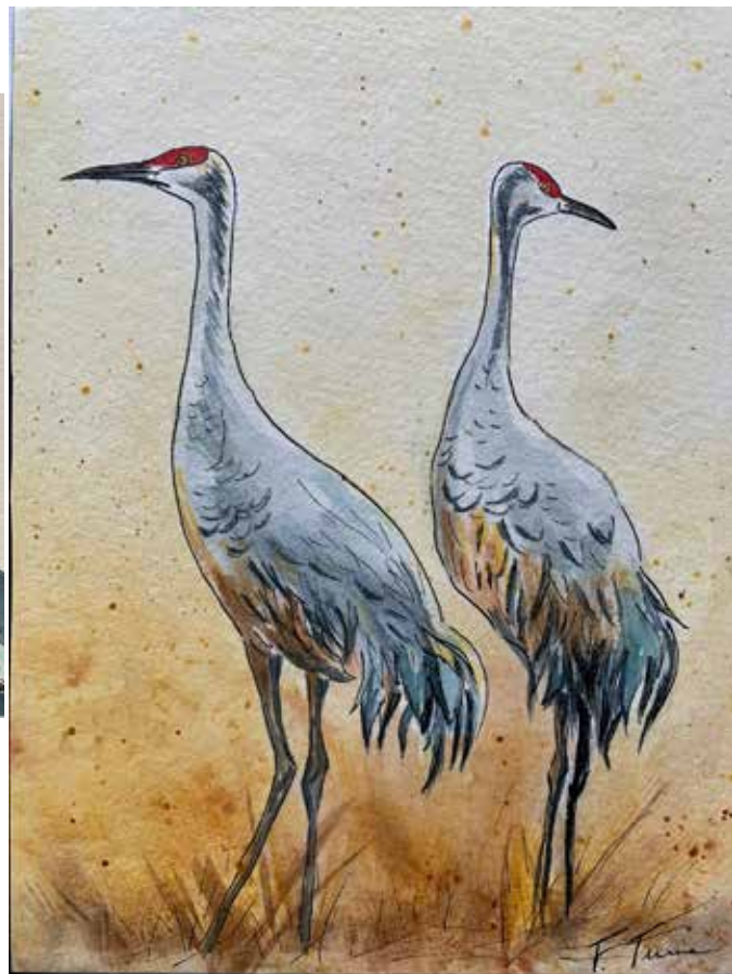
Sandhill Cranes #1

Peninsula Bruce Trail Club member and visual artist, Fran Turner, created 10 paintings of birds which she offered to the club to raise funds to support bird habitat protection and conservation. Photographs of two of Fran’s paintings are shown here. Sales of the paintings raised $1250. Thanks to Fran for donating these beautiful works of art!