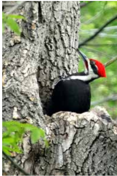
A hard working pileated woodpecker. The “Paul Bunyan” of birds.