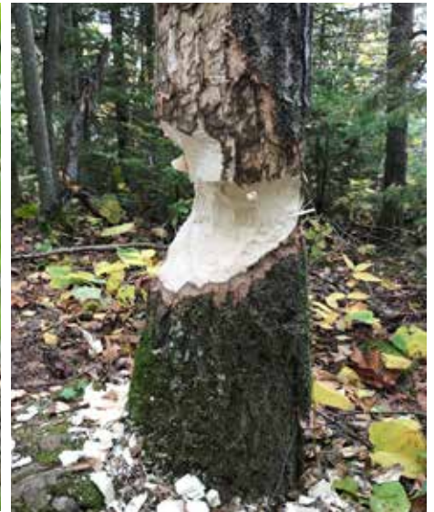
Beavers sometimes leave trees like this.

Above: Sawyer Rich Moccia examining the dedicated work of a pileated woodpecker. These cavities weaken the structural integrity of the tree. This one was close to the trail and had to be cut down for safety.