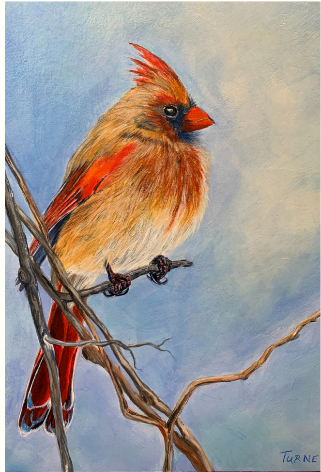
PRETTY LADY BY FRAN TURNER

The popular fundraiser is back for 2023, showcasing local Saugeen (Bruce) Peninsula talent for a good cause