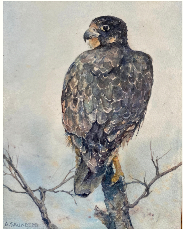
PEREGRINE FALCON BY ARLENE SAUNDERS

Your support can help us make a difference! Here is a short story to illustrate - Following a visit to the Grade 3-4 classroom, one of the students recognized me at the local grocery store, and intentionally followed me to initiate a conversation about birds, "Guess what we saw at school this week? About 100 Bohemian Waxwings! They were beautiful!" That made my day - the fact that the student was excited about birds and wanted to share their observation with me, told me they were smitten with the love for birds. They already see nature's beauty and understand the importance of protecting it.